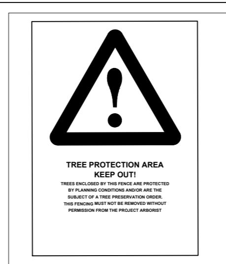
Tree Protection Signage